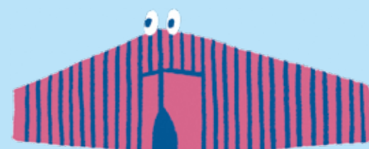
NEBUTA MUSEUM WA RASSE

The "motsuke" men compete in an exciting tug-of-war in the snow. After the battle, winter fireworks will color the finale!