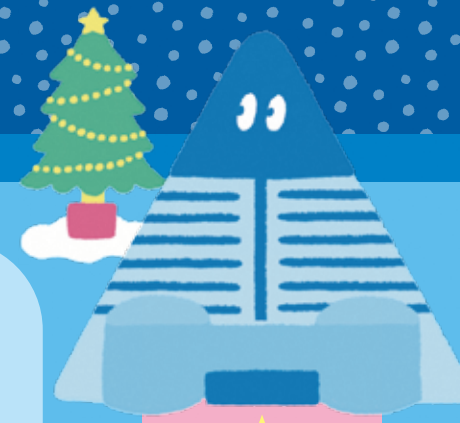
AOMORI PREFECTURAL CENTER FOR INDUSTRY AND TOURISM, ASPAM